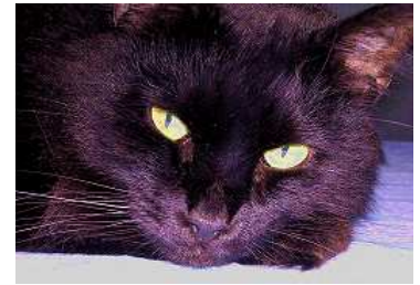
Layout done by : Shayla McGinnis